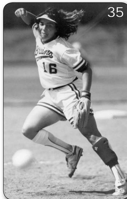
Bruin Softball History Four-Time All-American Lisa Fernandez