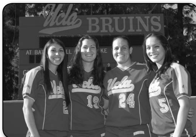
The 2006 UCLA Senior Class (Left-Right):